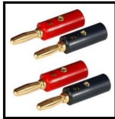
Example banana plugs