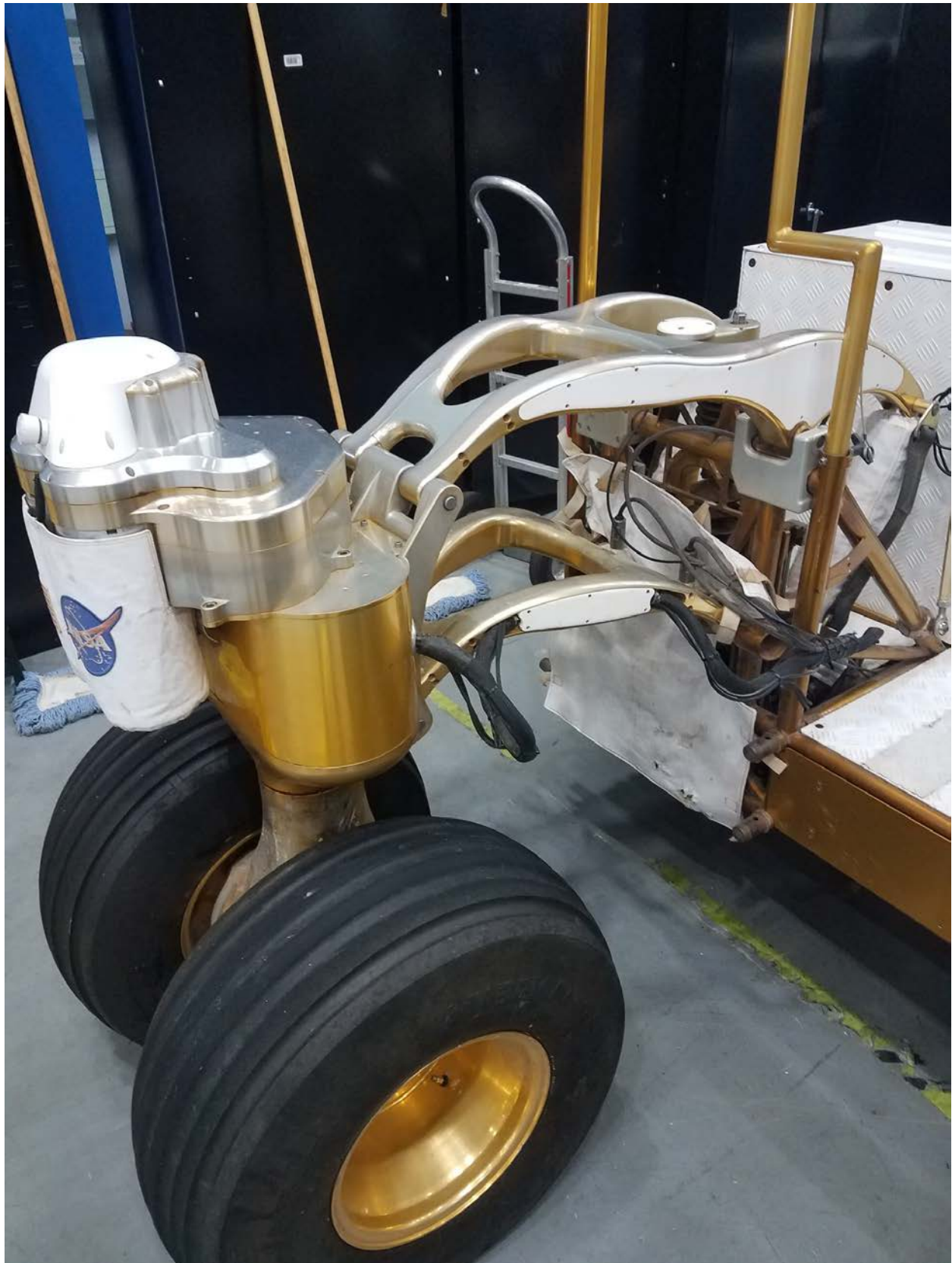
Figure 3: Closeup of wheel in lowered position on rover