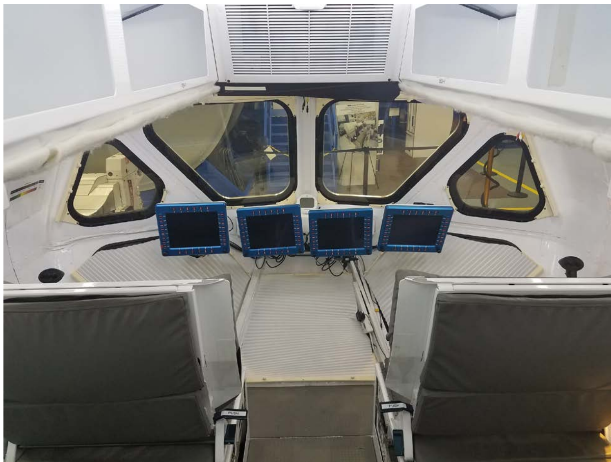
Figure 4: Control panels inside the rover