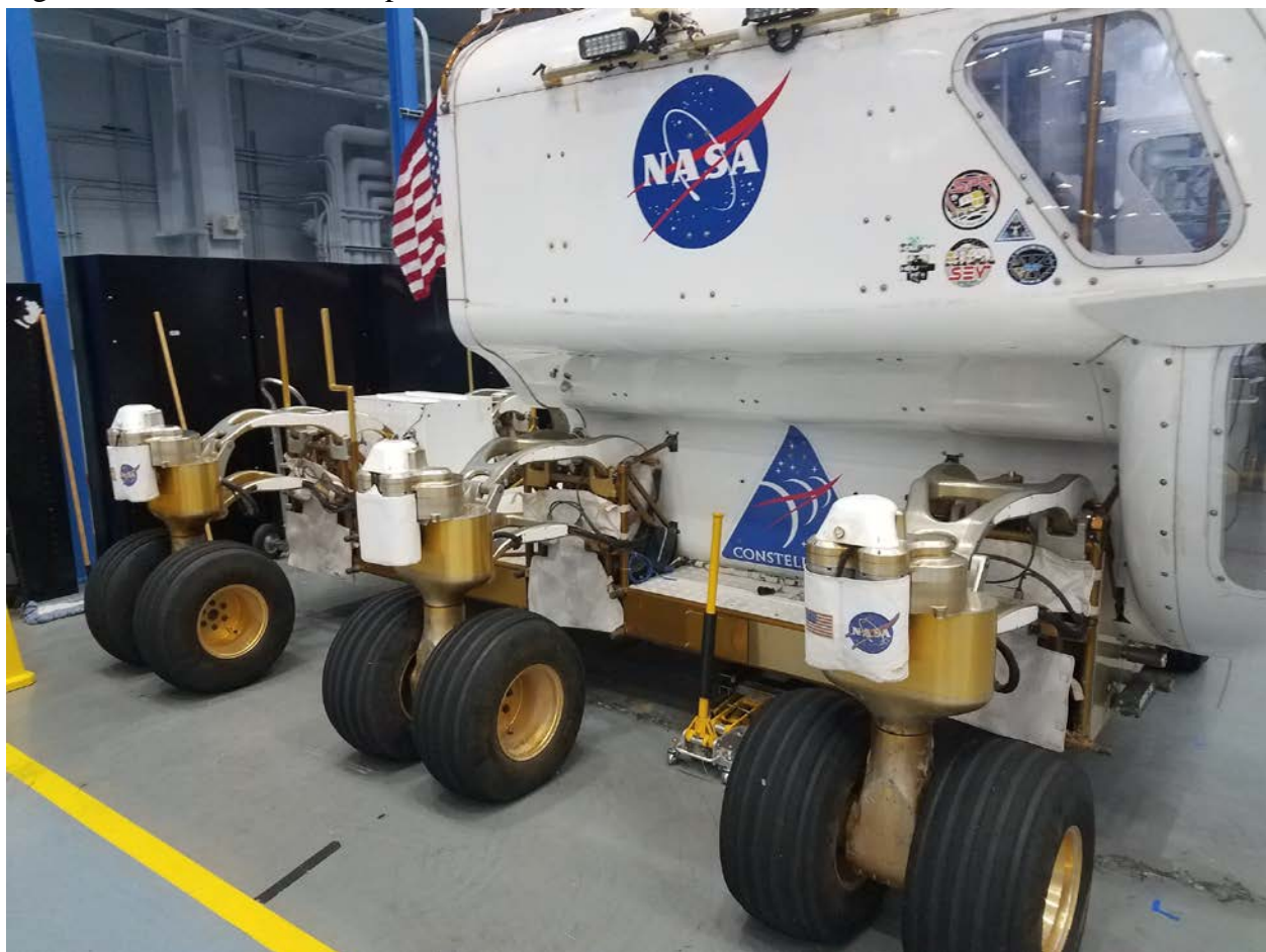
Figure 2: Pressurized moon rover